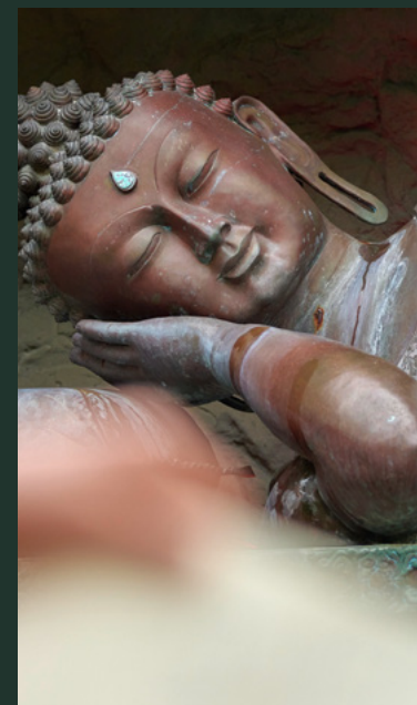
The Nirvana Buddha – the largest reclining Buddha cast in bronze outside of Asia